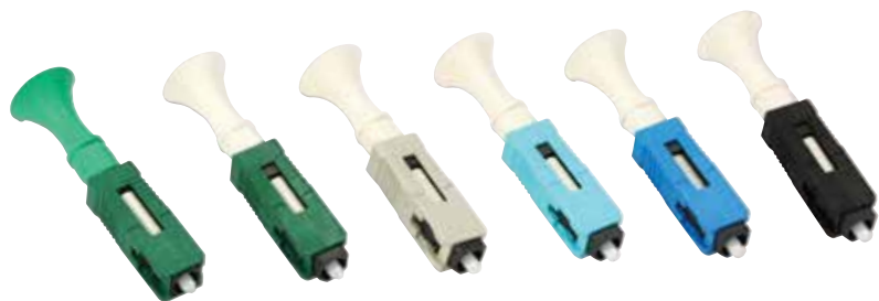
3M™ No Polish SC Connector Family