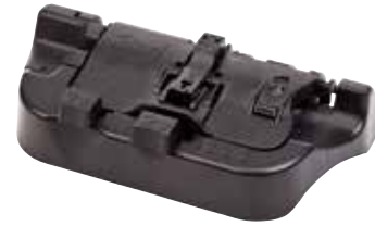
3M™ Easy Cleaver

Unlike other blade-enabled fiber cleaving tools, the 3M Easy Cleaver requires no maintenance because of its diamond wire cleaving mechanism. Use it to create smooth end-faces repeatedly – each tool performs up to 120 cleaves. See the ordering chart for specific details on packaging.