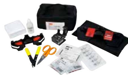
3M™ Fibrlok™ Splice Kit with Cleaver 2559-C