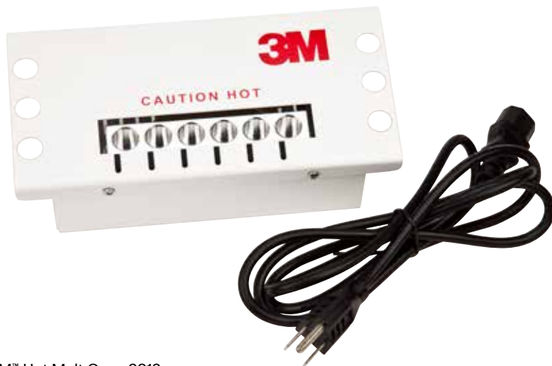
3M™ Hot Melt Oven 6312