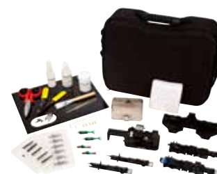
3M™ Fiber Optic Angle Cleaver Kit 2565 includes 3M™ Fiber Optic Angle Cleaver 2535, 3M™ Fibrlok™ Angle Splice Assembly Tool 2501-AS and all tools necessary for 3M™ Fibrlok™ Angle Splices.

The 3M Fiber Optic Angle Cleaver Kit 2565 provides the tools to terminate the 3M Fibrlok Angle Splice 2529-AS and 2540-AS. Also included in the kits are the 3M No Polish Connector Assembly Tools 8865-AT and 8835-AT for terminating SC and LC angle splice connectors. Replacement parts are available.