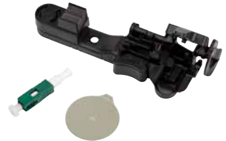
3M™ Crimplok™+ Activation Tool, a Singlemode SC APC 250/900um connector and a lapping film