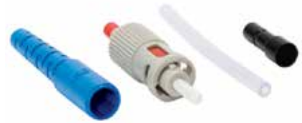
3M™ Crimplok™ ST Connector

By using proven malleable metal element fiber-gripping technology, these connectors are designed to be easily installed virtually anywhere without the need for electrical power.