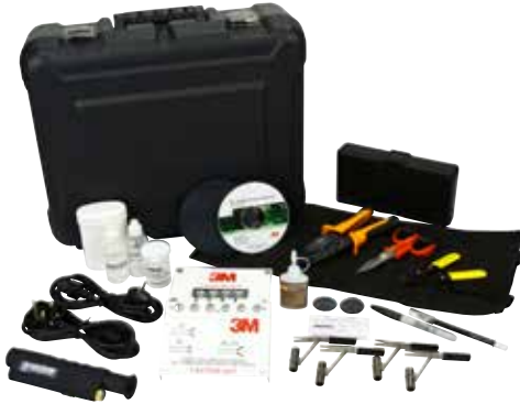
3M™ Hot Melt Termination Kits 6366 and 6362-230V

3M™ Hot Melt Termination Kits 6366 (120V oven) and 6362 (230V oven) contain the tools and materials necessary to terminate 3M™ Hot Melt SC, ST, and FC Connectors, both singlemode and multimode. The 3M™ LC Hot Melt Expansion Kit 6650-LC is used in addition to the 6366/6362 hot melt termination kits to terminate 3M™ Hot Melt LC Connectors.