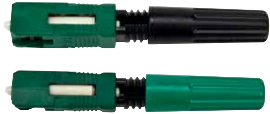
3M™ No Polish SC/APC Connector Flat and Angle Splice 1.6-3 mm Jacket