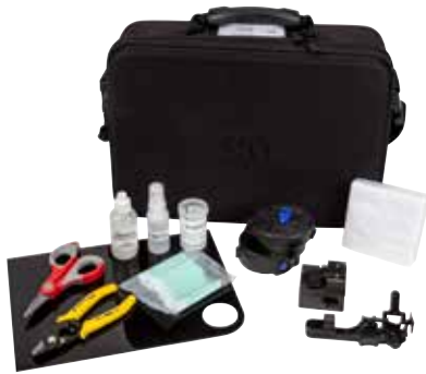
3M™ Crimplok™+ SC/UPC Connector Kit 8765T-UPC for 3M™ Crimplok™+ Connectors 8700-UPC and 6700 Series

3M™ Crimplok™+ Connector Kits 8765T-UPC/8765T-APC provide the tools needed to terminate 3M Crimplok+ Connectors 8700-UPC 6700 and 8700-APC series, respectively. Both kits contain the same fiber preparation tools including a high quality cleaver, a work surface and a case with an integrated hook for easy hanging. Each kit contains a specific 3M™ Crimplok™+ Activation Tool and 3M™ Crimplok™+ Nano Finishing Tool, depending upon the connector type. UPC tools provide a square finish while APC tools provide a 8° angled finish.