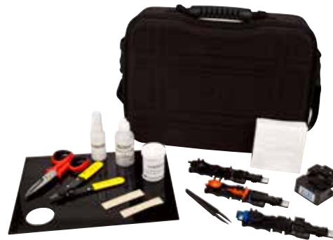
3M™ No Polish Connector Premium Kit with Cleaver 8865-C/PR