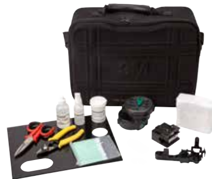
3M™ Crimplok™+ SC/APC Connector Kit 8765T-APC for 3M™ Crimplok™+ Connectors 8700-APC