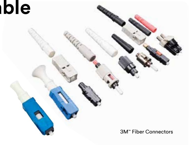
3M™ Fiber Connectors

Reliability and a craft-friendly installations make 3M field installable connectors popular among contractors and industry professionals. 3M connectors can help maximize time in the field with factory-prepped shortcuts and high performance tools. Choose from a full line of fiber connectors with ceramic ferrules.