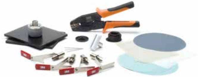
3M™ Hot Melt LC Expansion Kit 6650-LC